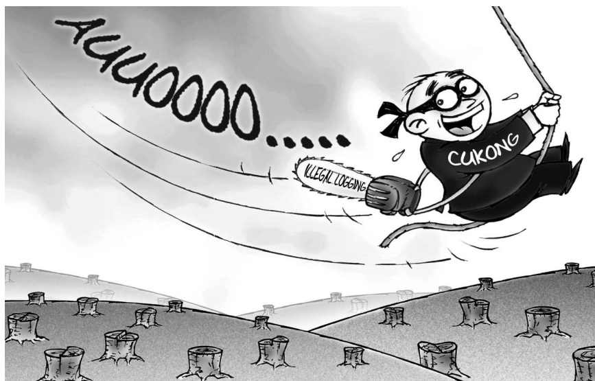
Figure 2. Cartoon in provincial newspaper. Picturing how the Malaysian timber barons ( cukongs ) roamed freely in executing their logging business (Photo courtesy: Pak Kekes, Pontianak Post, 16 September 2006).

In 2004, as a result of central government attempts to regain authority over the lucrative forestry sector and reduce immense public criticism of the national authorities' incompetence in dealing with illegal logging along the border with Malaysia, Indonesian President Susilo Bambang Yudhoyono pledged 'tough action' against illegal loggers throughout Indonesia (Jakarta Post 2004b). This statement was later followed by a presidential decree directed at eradicating all such 'wild logging'. In state rhetoric, the word 'liar' or 'wild' is often