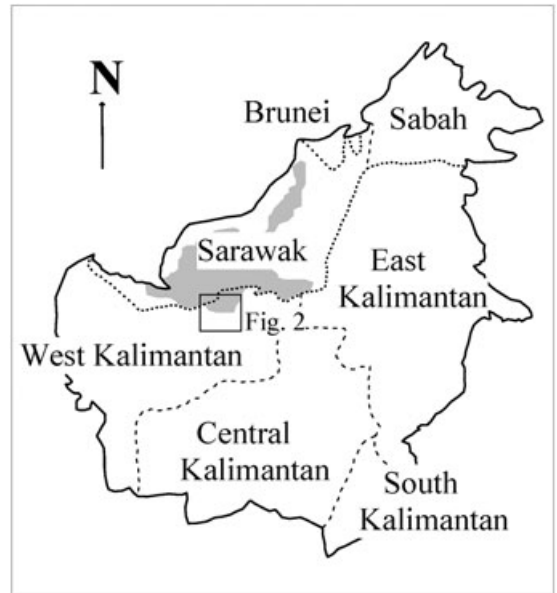
Figure 1. Iban population distribution throughout Borneo

As an ethnic label, Iban refers to a widely distributed portion of the population in northwestern Borneo. 2 Self-described Iban make up the largest single ethnic group in the Malaysian state of Sarawak, while across the border in the province of West Kalimantan, the Iban constitute a small minority, primarily residing in five subdistricts along the border (Fig. 1). The Iban